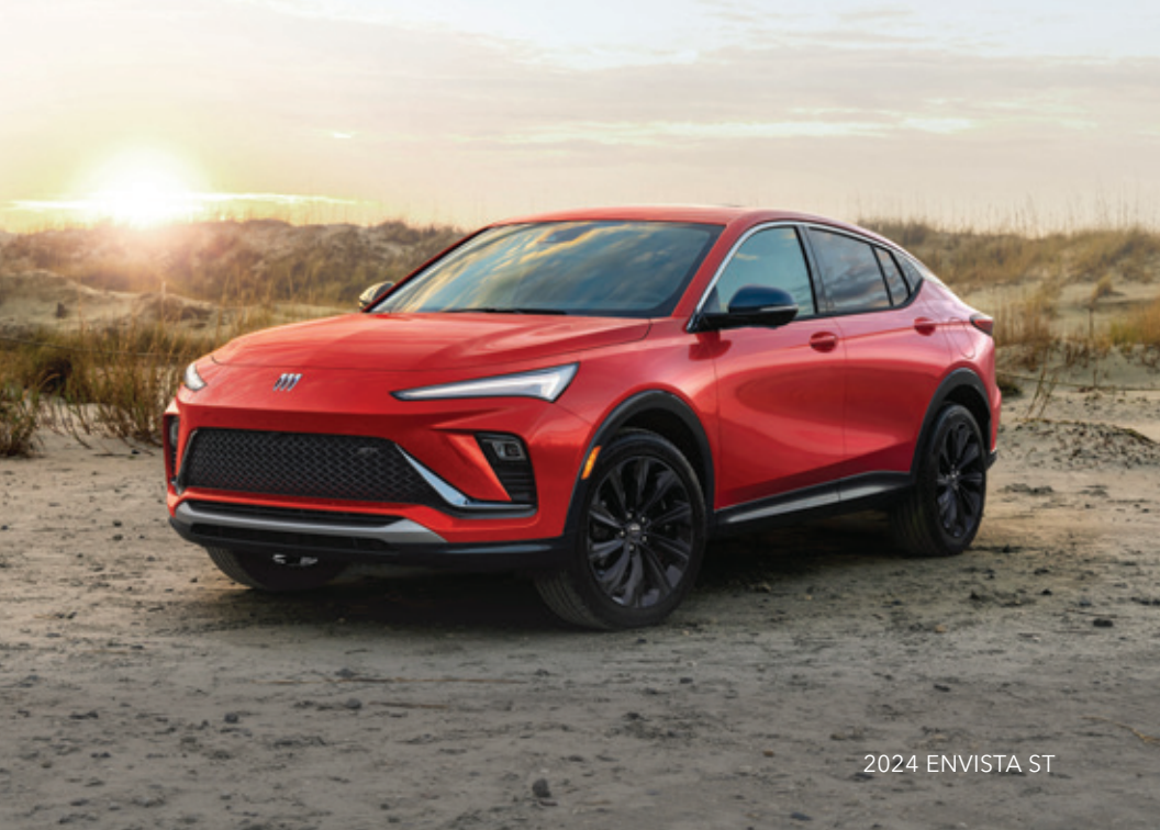
2024 ENVISTA ST