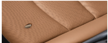
Upholstery holes more than 1/8"