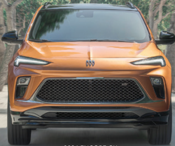
2024 ENCORE GX