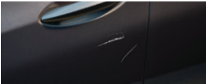
1 dent (more than 4") or 1 scratch (equal to or more than 6") per panel