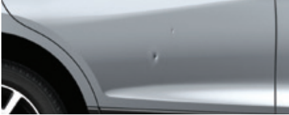
4 or more dings per panel