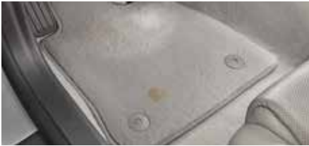
Removable stains and minor carpet wear