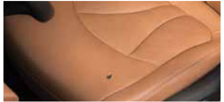
Upholstery holes larger than 1/8"