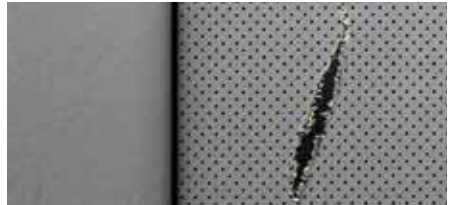
Tears larger than 1/2"