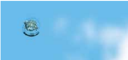
Cracked glass less than 1/2" in diameter