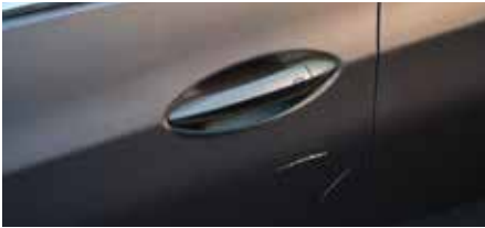
1 dent or 2 scratches (less than 4") per panel