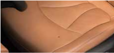
Upholstery holes smaller than 1/8"