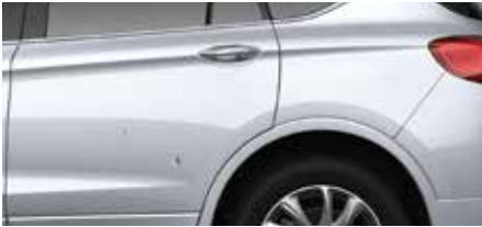
Fewer than 4 dings (less than 2") per panel