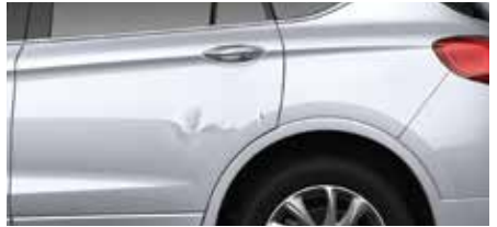
Hail damage or punctures on any panel