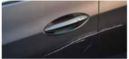
1 dent or 2 scratches (more than 4") per panel