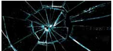
Cracked glass greater than 1/2" in diameter or spidered cracks