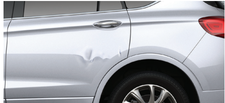
Hail damage or punctures on any panel