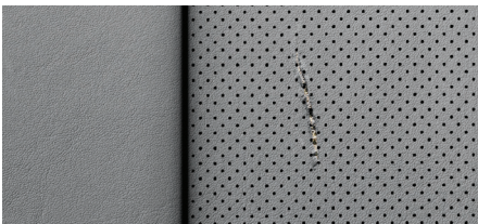
Tears smaller than 1/2"