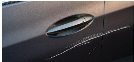
1 dent or 2 scratches (more than 4”) per panel