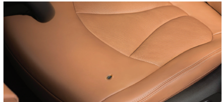
Upholstery holes larger than 1/8"