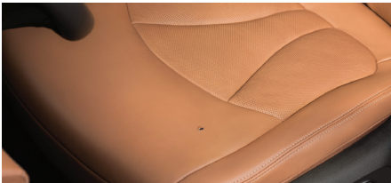
Upholstery holes smaller than 1/8"