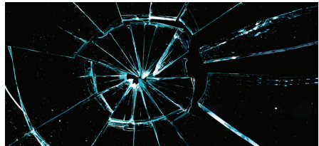
Cracked glass greater than 1/2” in diameter or spidered cracks