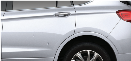
Fewer than 4 dings (less than 2”) per panel