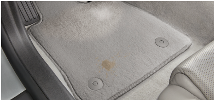
Removable stains and minor carpet wear