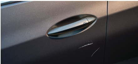
1 dent or 2 scratches (less than 4”) per panel